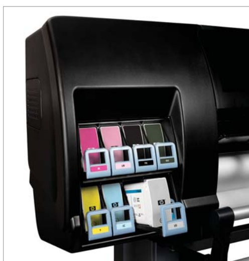
HP Vivera inks on the Z6100.

Working with a 42-inch Z6100PS unit, we found the HP setup and installation documentation top rate. In less than three hours the unit went from crate to full operation. Out of the box the Z6100 includes an automatic cutter, spindle, printheads, eight 775ml ink cartridges, a maintenance cartridge and kit, a 25-foot sample roll of HP Heavy-weight Coated Paper, the stand and basket, a